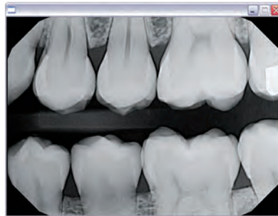
Easily capture both horizontal and vertical bitewings