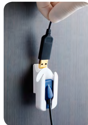
The wall-mount cradle safely stores the sensor and USB connector

Gendex GXS-700 is a USB certified device and shall be used with USB compliant cables suitable for Hi-Speed USB 2.0 components. Certified USB cable extenders are available from Gendex. Certified powered USB active hubs can also be used to extend the distance to the USB host/computer. The length of the cable connection to the hubs or between hubs shall not exceed 15 feet (5 meters).