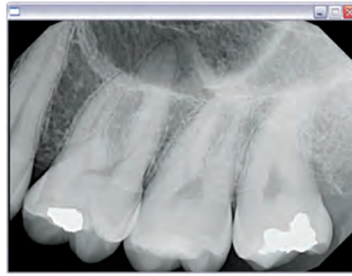
Effortlessly capture high definition images of challenging areas such as third molars and long-rooted canines

Utilizing the latest sensor technology, the GXS-700 system delivers real-time images of truly amazing clarity and detail — greatly supporting diagnosis and treatment.